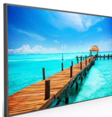
21.5-65" Open Frame